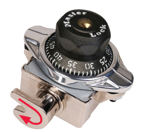
Latch Wraps Around The Latch Plate

The patented model 1690, 1695MKADA, and 1790 built-in locks use the same technology as an automotive door lock system, utilizing slam shut operation combined with a rotating latch that wraps around the latch plate. Designed for Single Point Latch Lockers, these locks provide the most robust design and requires the least adjustment for proper operation (U.S. Patent No. 7,984,630).