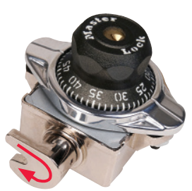
Latch Wraps Around The Latch Plate